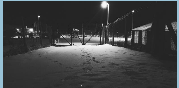
This atmospheric night time shot by member Dale Dempster shows our entrance gate lit up by the recently fixed WW2 era lamp post.