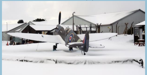
Captured by member Neil Werninck this fantastic picture shows our Red Lightie Spitfire 'weathering the storm' during our recent snowy weather.