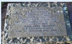
Right: His headstone in Edzell.